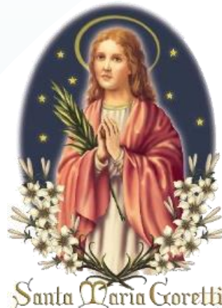
Santa Maria Goretti