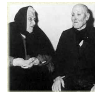
Assunta Goretti (Maria's mother) and Alessandro Serenelli

mother and accompanied her to Christmas Mass in the parish church, where he spoke before the hushed congregation, acknowledging his sin and asking God's forgiveness and the pardon of the community.